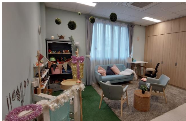
From L to R, Top to Bottom: Lift Lobby and Common Corridor; Drop-In Centre, Counselling Rooms for Individual and Groups.