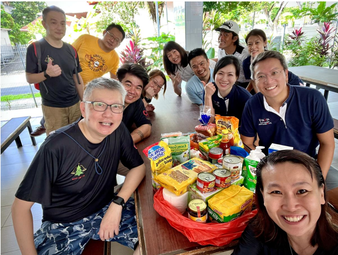
PFS with the Hao Ren Hao Shi team at our first distribution event in October 2022.

Our collaboration with 好人好事 Hao Ren Hao Shi (HRHS), another non-profit organisation, has enabled our beneficiaries - desistors and their families, who have been blessed to in turn, be a blessing to others, by helping to pack and distribute essential grocery supplies for the community. This collaboration with HRHS stemmed from a natural synergy of corporate missions. HRHS' mission is to improve the lives of the underprivileged and needy families through the provision of 28 essential grocery items, with our beneficiary and volunteer community helping to pack and deliver these grocery packs, many of whom are private hire drivers. This meaningful activity, happens on the first Saturday of every month, and has benefited more than 80 families since its first distribution in October 2022. This collaboration was intentional to set the stage for more such partnerships to give us a wider reach with lower duplication in effort.